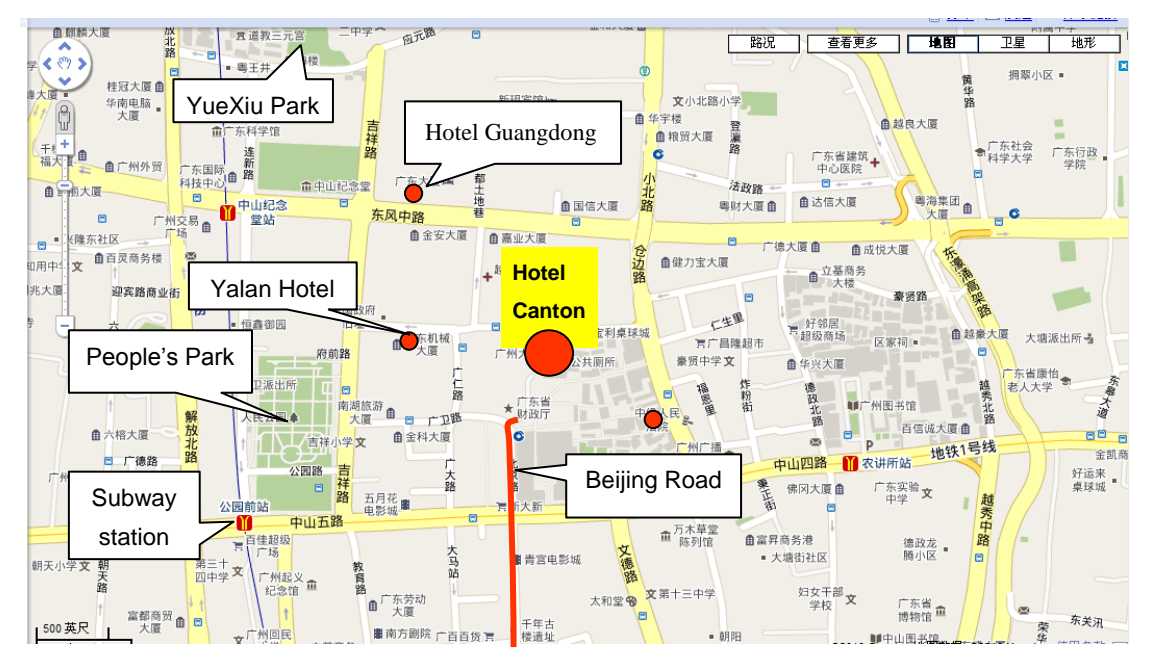
Location of Hotel Canton and its vicinity