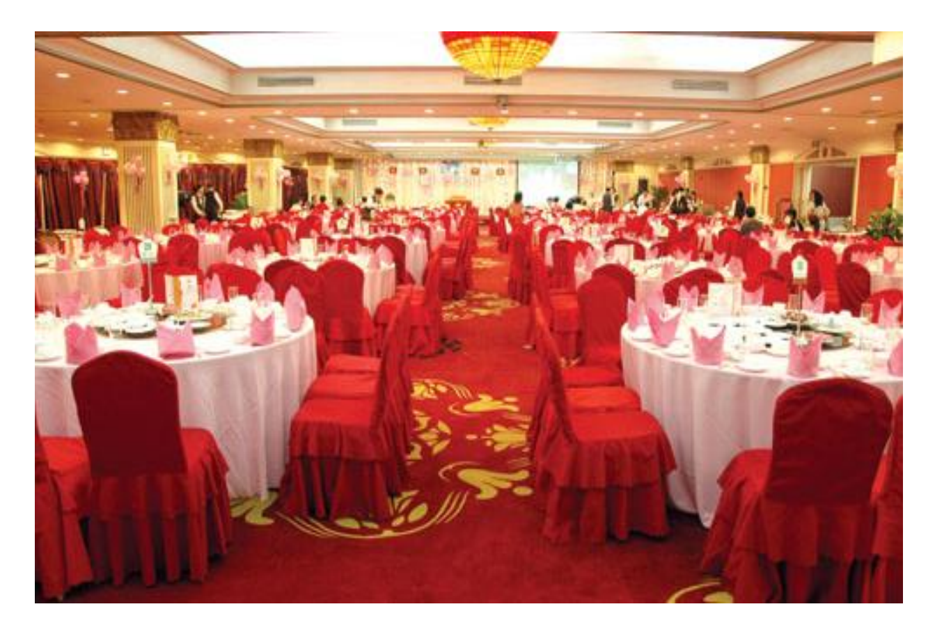
Conference Hall of Hotel Canton