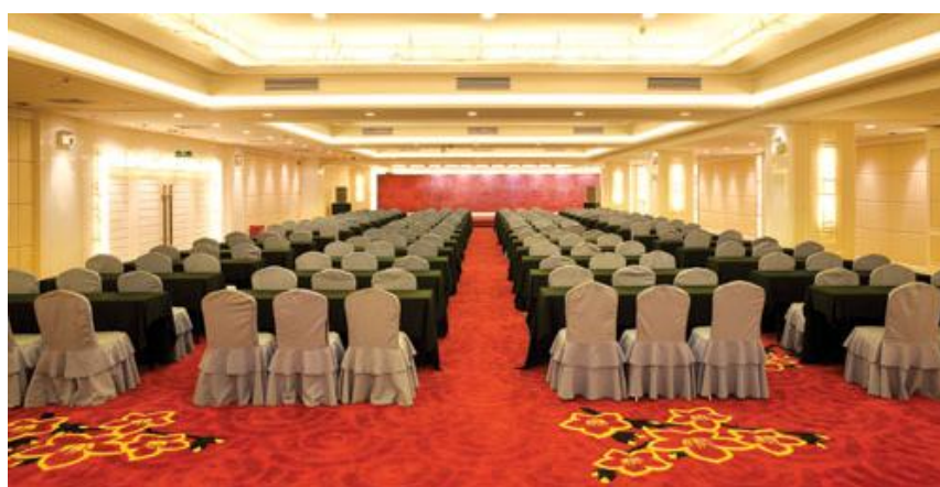
Conference Hall of Hotel Canton