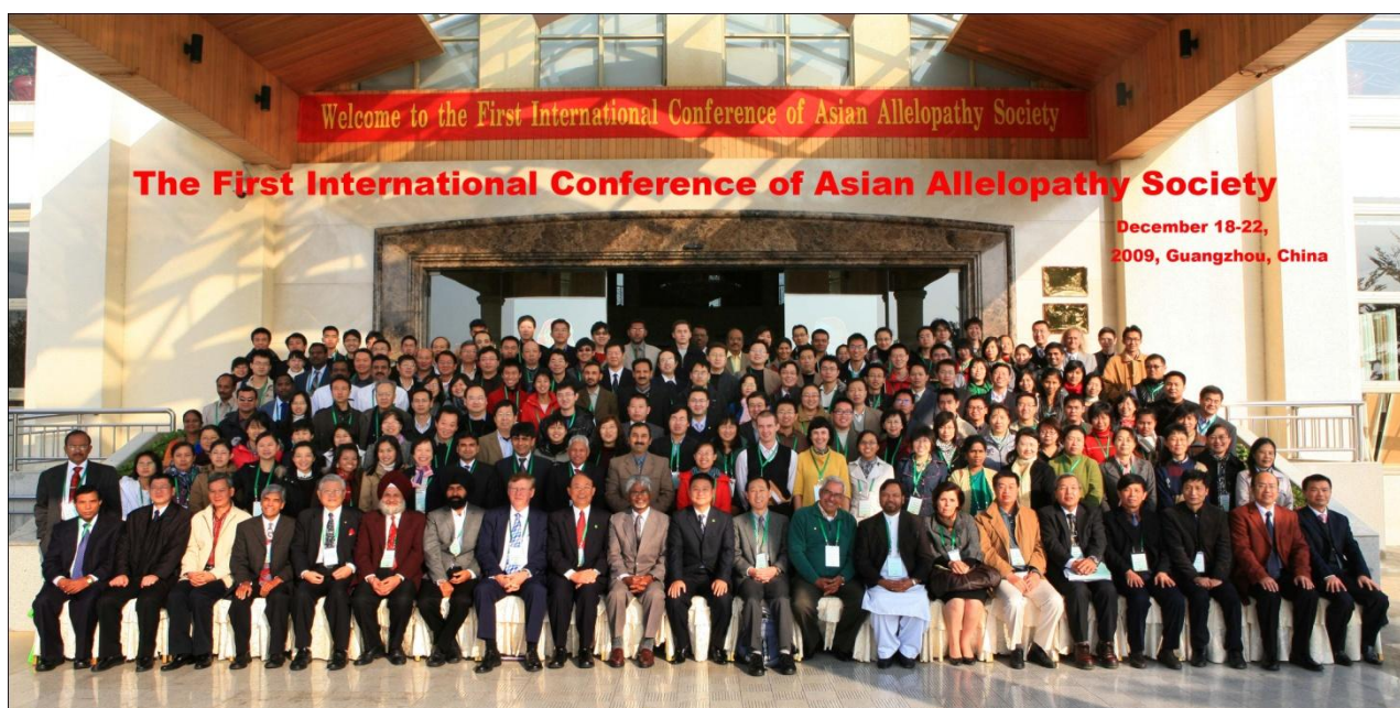
Participants in the First International Conference of Asian Allelopathy Society