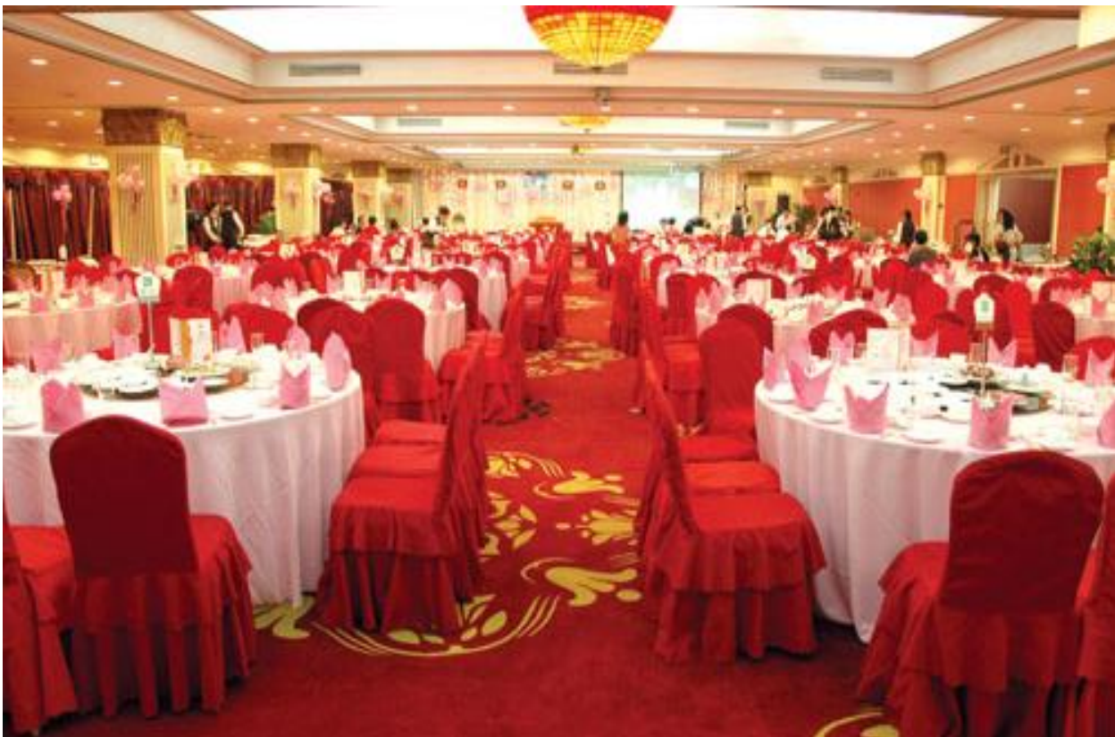
Conference Hall of Hotel Canton